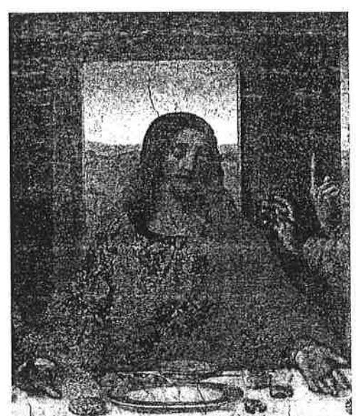
Jesus Christ at the Last Supper