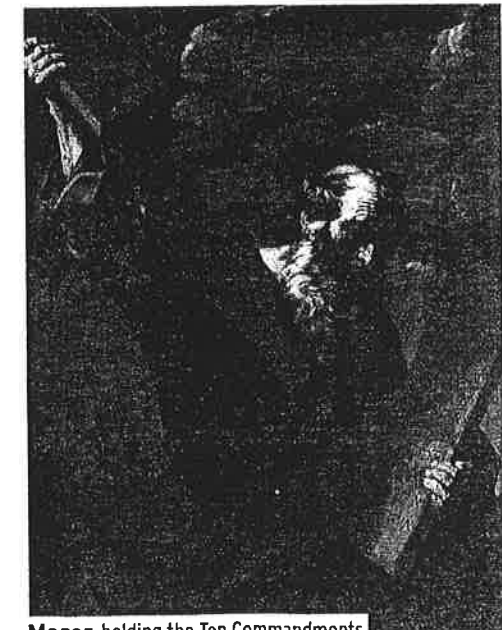
Moses holding the Ten Commandments