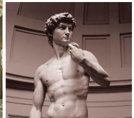
The Last Judgment – Sistine Chapel; David