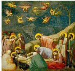
Painted frescos such as The Morning of Christ