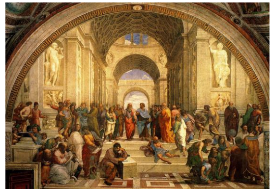
The School of Athens