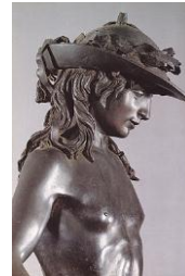
1 st free standing nude since ancient times; realistic postures and expressions