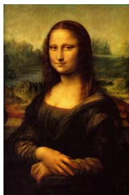
The Last Supper and The Mona Lisa , engineer and architect