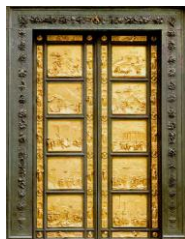
Doors of the Cathedral of Florence