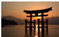
Torii Gate (Shinto)