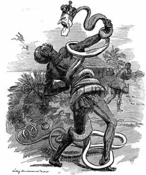
IN THE RUBBER COILS. BENZIE—The Congo "Free" State.